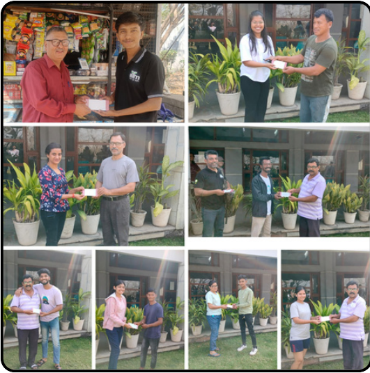
Students gifting the funds raised through Alumni to the IIFM's Mess Staff