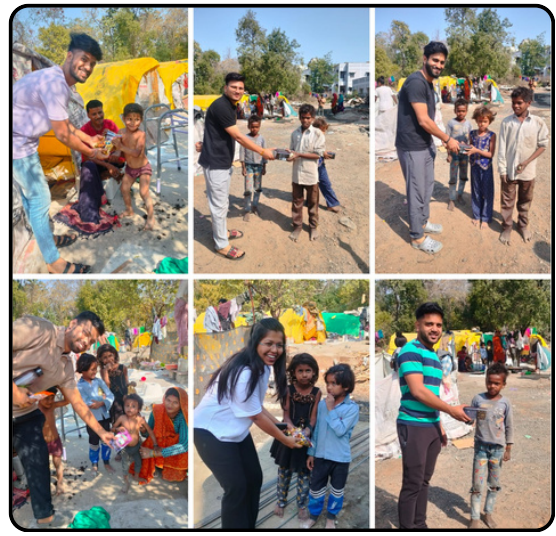
Students gifting chocolates and toffees to the kids of the construction workers at IIFM