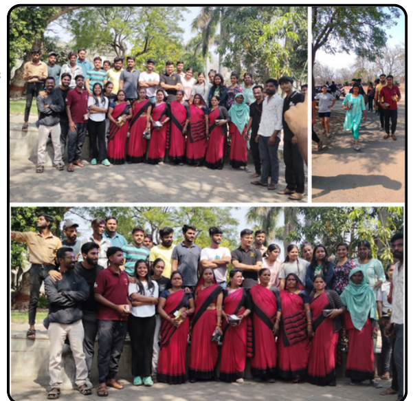
Group photo with the cleaning staff didis