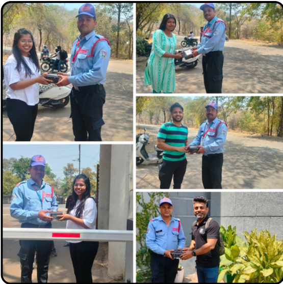
Students gifting chocolates to the guard bhaiya at IIFM