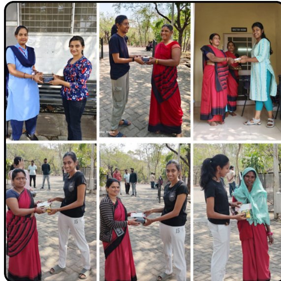
Students gifting funds and chocolates to the cleaning staff didis