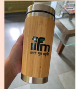
IIFM FLASK Rs. 850/-

For IIFM Merchandise, You can place your order on WhatsApp number Ms. Amrita : +91 93032 83826