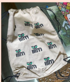
IIFM CANVAS BACKPACK Rs. 250/-