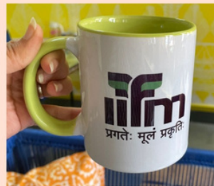
IIFM MUG Rs. 250/-